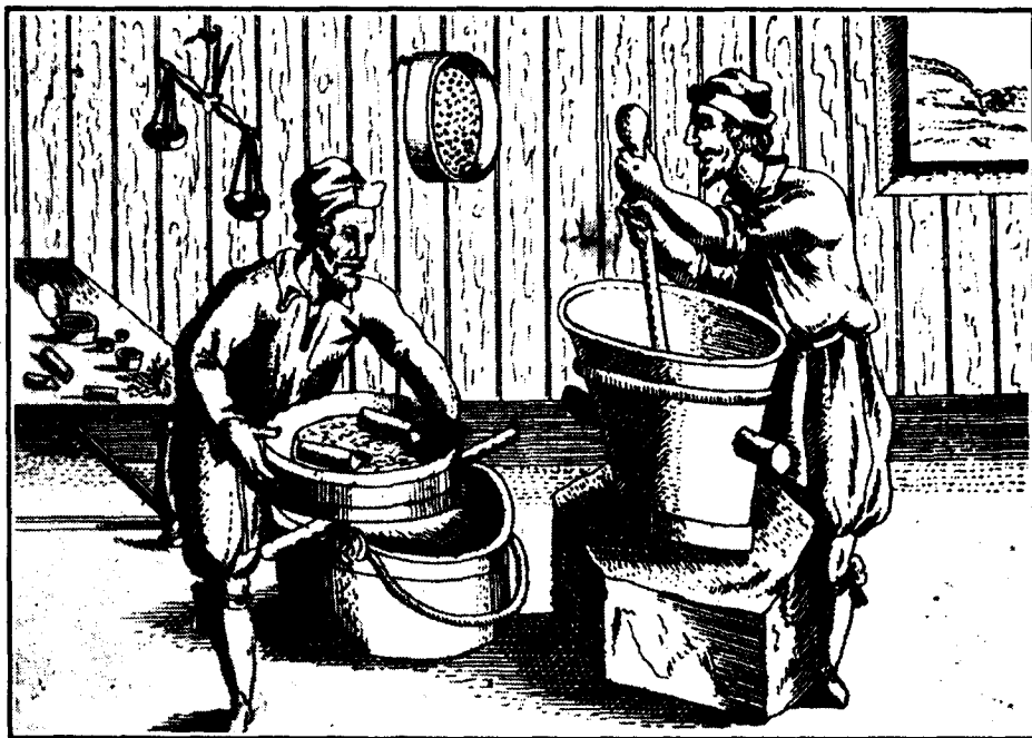
FIGURE 18. Gunpowder Manufacture, Lorraine, 1630. After the materials had been intimately ground together in the mortar, the mixture was moistened with water, or with a solution of camphor in brandy, or with other material, and formed into grains by rubbing through a sieve.

John Bate early in the seventeenth century understood the individual functions of the three components of black powder