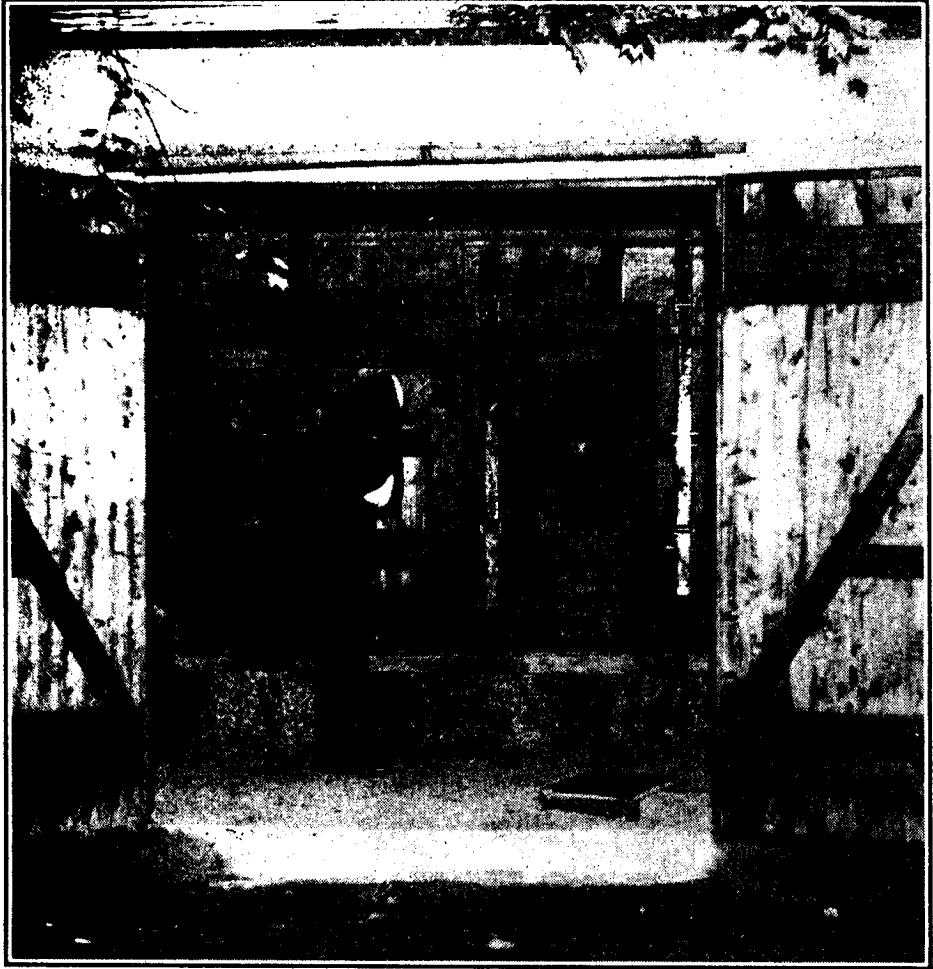
FIGURE 19. Stamp Mill for Making Black Powder. This mill, which makes powder for use in the manufacture of fireworks, consists of a single block of granite in which three deep cup-shaped cavities have been cut. The stamps which operate in these cups are supplied at their lower ends with cylindrical blocks of wood, sections cut from the trunk of a hornbeam tree. These are replaced when worn out. The powder from the mill is called "meal powder" and is used as such in the manufacture of fireworks. Also it is moistened slightly with water and rubbed through sieves to form granular gunpowder for use in making rockets, Roman candles, aerial bombshells, and other artifices.